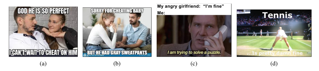
Figure 4: A sample of false negatives from the test set on the misogyny identification task.

score composed of a promising 75% in precision and 71% recall. While performance between stereotype and objectification are close, the system underperformed in the shaming category. We think this behavior is due to the broad kind of both visual and textual content that can convey shameful messages and is hence more difficult to learn. Finally, the model performed best in violence , where it is probably simpler to identify visual clues that let intend a violent message.