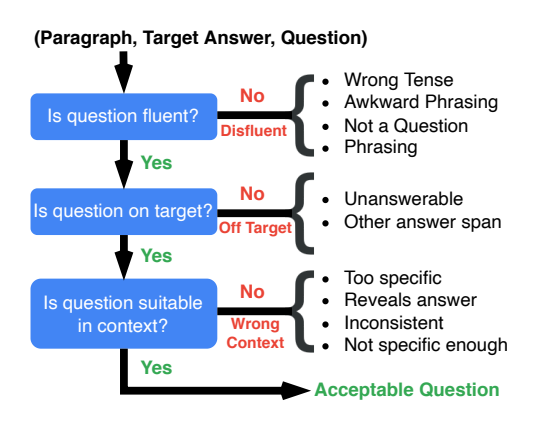
Figure 2: Hierarchical categorization of errors for question generation. Three error categories (Disfluent, Off Target, Wrong Context) each with several subtypes.

2018), to knowledge-graph QGen (Indurthi et al., 2017), multiple-choice distractor generation (Araki et al., 2016) and answer-aware QGen (Sun et al., 2018), in which given a context paragraph and a target answer, the model must generate a question answered by the target. We select the answer-aware QGen setting for our evaluation, as it allows for teachers to guide the QGen model by selecting desired concepts to include in the quiz by selecting target answers.