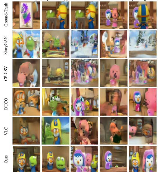
Figure 2: Qualitative comparison on Pororo-SV.

approach generates a ball, aligned with the given first sentence, while other methods fail to generate the required ball object on the grass.