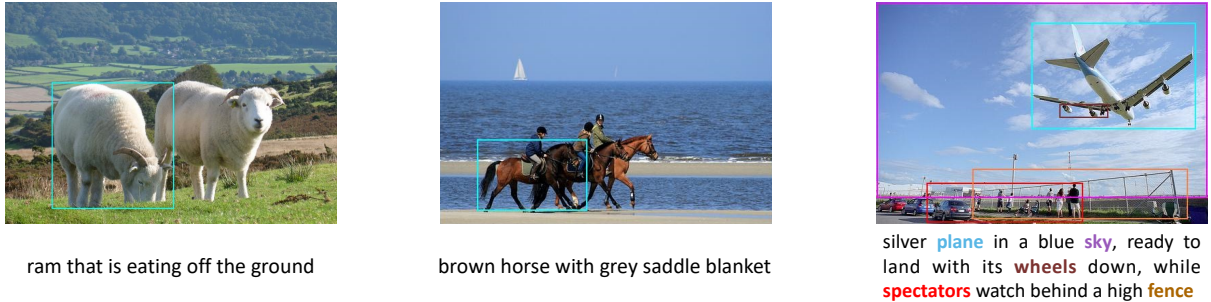
Figure 2: Case study on referring expression comprehension and phrase grounding tasks.

In principle, to achieve explicit position augmentation, VQA can be decomposed into two position-sensitive stages, including an object grounding (position-output) stage and a question answering (position-input) stage. However, in our experiments, we find that the unneglectable errors in current visual grounding models constitute a bottleneck for such a two-stage model. Therefore, we turn to an ideal experiment, where the ground-truth object positions are available. Specifically, we adopt the object position annotation provided by the GQA dataset (Hudson and Manning, 2019). We explicitly indicate the position of each object in a similar approach as in position-input tasks (see Section 3.3). Then the position-enhanced question is put into the prompt template: “ q answer: [MASK]”. Finally models are asked to generate answer tokens from answer candidate set. We use the same approach as in visual relation detection to cope with multi-token answers.