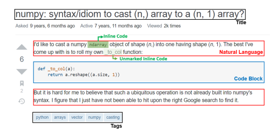
Figure 2: Example StackOverflow question with labeled elements. The corresponding rewritten intent for this question is "add a new axis to array a."

Yet open-domain programming question answering on sites such as StackOverflow(SO)<sup>2</sup> has remained an elusive goal. Yin et al. (2018) created an annotated dataset with the site in which the intent and answer snippet pairs were automatically mined from the question. They then had crowd workers rewrite the intents to reflect the corresponding code better. Currently, state-of-the-art was achieved by pretraining an LSTM model on resampled API and mined data (Xu et al., 2020). Subsequent work conducted an empirical study on the effectiveness of using a code generation model in an IDE plugin and find that developers largely had favorable opinions of their experience(Xu et al., 2021). An inherent issue with the approach of Xu et al. (2020), more fundamentally the dataset and parameters of the task, is that the intent can only contain a limited amount of information.