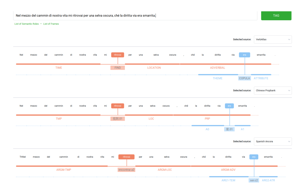
Figure 3: The beginning of the Divine Comedy by Dante Alighieri in Italian as tagged by InVeRo-XL with three predicate-argument structure inventories – VerbAtlas, the Chinese PropBank and the Spanish AnCora. "Nel mezzo del cammin di nostra vista mi ritrovai per una selva oscura, ché la diritta via era smarrita" translates into "Midway upon the journey of our life I found myself within a forest dark, for the straightforward pathway had been lost".

tic roles as provided by InVeRo-XL. Thanks to a dropdown menu, users can immediately switch from the labels of one inventory to those of another, independently of the input language, without reloading the Web page. We argue that this Web interface should help teachers explain SRL to their students, allow linguists to compare linguistic inventories on particular case studies, attract new researchers to the field, and inspire others to exploit SRL in downstream tasks or even real-world scenarios.