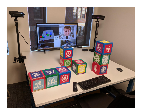
Figure 1: The blocks world apparatus setup.

Eta is a dialogue manager (DM) designed to follow a modifiable dialogue schema, specified using