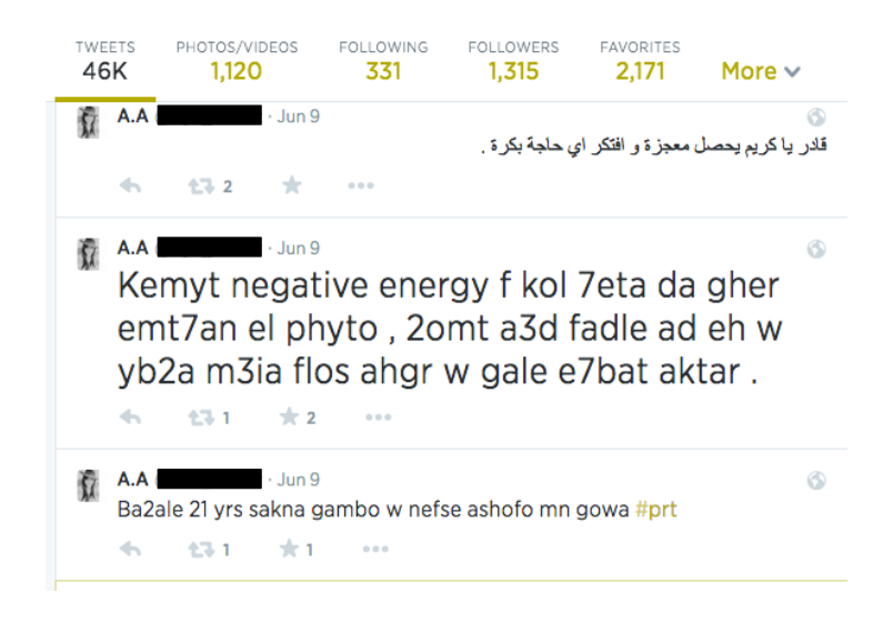
Figure 1: Examples of Arabizi mixed with Arabic and English in Twitter

dialects \neq may be pronounced as [g] (as in god), [3] (as in vision), or [\hat{d_3}] (as in juice), and that the digraph "dj" is used in French for [\hat{d_3}] .