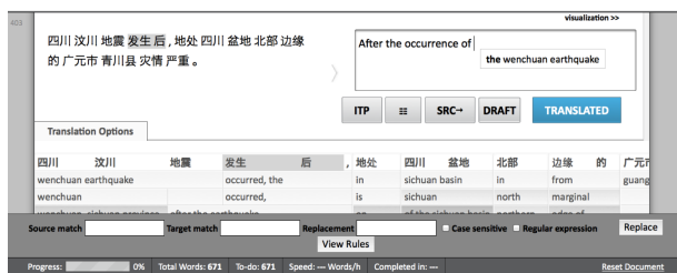
Figure 4: Translation User interface (CASMACAT). The user can see the source sentence (e.g. in Chinese) on the left pane, and can type in or post-edit the translation (e.g. in English) on the right pane.

may be slow to retrain when provided new annotations (such as if retraining in batch mode, from scratch), or be quick to update (such as if supporting incremental training). As the broker moderates the client interaction, then no matter the promptness of the AL backend, the annotator(s) will always have work to do, determined by the most recent update to the annotation ordering.