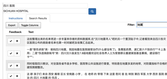
Figure 2: Discovery user interface

information in structured form. To do so, she exports the search results to our Extraction interface, where she can provide annotations to help train an information extraction system. The Extraction interface allows the user to label any text span using any schema, and also incorporates active learning to complement the discovery process in selecting data to annotate.