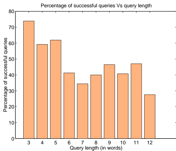
Figure 3: Effect of query length (20 retrieved documents and maximum paraphrases)

query length in words (20 documents were retrieved using 19 or maximum paraphrases). These results were obtained for the settings Col, W_{order} = 1 and AbsAdjDiv=10 , with manually-corrected tagging. As seen in Figure 3, there is a drop in retrieval performance for queries with more than 5 words. These results generally concur with the observations in (Sanderson, 1994; Gonzalo et al., 1998). Nonetheless, on average we returned a correct document for 42% of the queries which had 6 to 11 words.