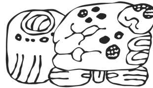
Figure 1: Sample of the ancient Mayan script, reading b'alam , “jaguar”, using a combination of the logogram and the syllabogram. Attribution: Goran tek-en under license CC BY-SA 4.0.

The Mayan language family is spoken in an area covering the modern states of Guatemala, Belize, and Southern Mexico (Law, 2014, p. 81). It consists of around 30 languages grouped into five or six major sub-groups, depending on the source (Campbell and Kaufman, 1985; Law, 2014). Most subgroups and most speakers are found today in Guatemala, where between 40-60% of the population are native speakers (Instituto Nacional de Estadística, 2018; England, 2003). Mayan languages are relatively healthy, but their presence online and on the global scene in general is almost