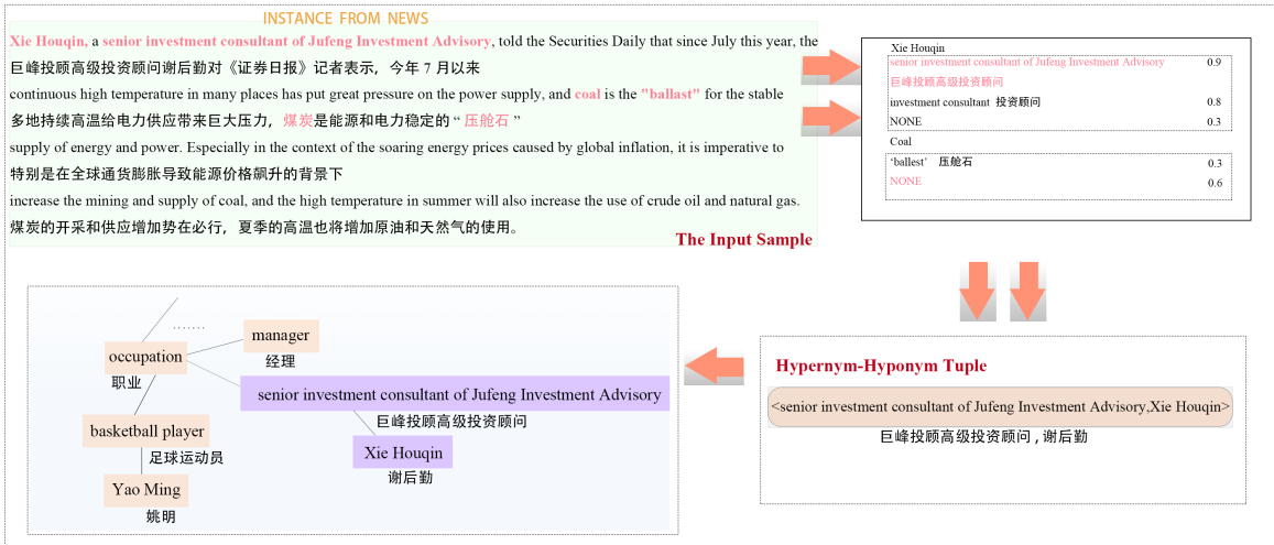
Figure 1: Hypernym discovery for taxonomy construction

hanced Prompt Learning (KEPL) method which utilizes both knowledge and latent semantics for end-to-end Chinese hypernym relation extraction. Specifically, our method employs a Dynamic Adaptor for Knowledge which can adaptively construct a unified representation for both the structured prior knowledge and the unstructured text context. To facilitate a more coherent integration of the structured prompts and unstructured text, we employ a mechanism that learns a unified representation of context through specific attention. For span selection, we use the focal loss to counteract the issue of sample imbalance, a commonly observed phenomenon in extractive tasks.