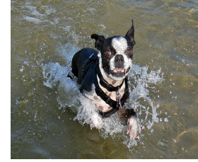
كلب أبيض وأسود يسبح في الماء