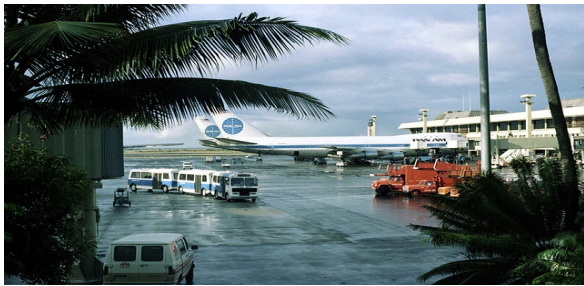
Figure 6. A sample from MSCOCO included in our AraCOCO.

English caption is not capturing all details in the image, annotators are encouraged to capture these lacking details in their Arabic captions. Each annotator gets to provide only one caption per image, This approach ensures having multiple perspectives to the captions on the same image. We provide an example image from AraCOCO in Figure 6, along with five different captions each acquired from one annotator in Table 1.