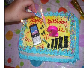
كعكة عيد ميلاد مع هاتف محمول عليها