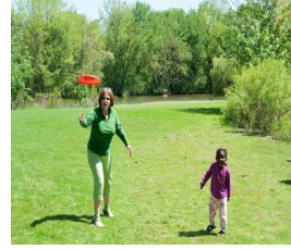
امراة وفتاة يلعبان بالفريزي على العشب

Captioning images involves describing the visual elements of a picture using natural language. This requires a system that combines the strengths of two models: one that can represent the visual elements of an image, and another that can translate this representation into natural language. The latter employs a language model to produce fluent (i.e., grammatically accurate) and adequate (i.e., capturing sufficient semantic information) descriptions. In recent years, research on vision language models (VLMs) and their applications has boomed (Alayrac et al., 2022; Wang et al., 2022; Huang et al., 2023). Owing to the rapid advancements in large language models (LLMs), the performance of VLMs has improved dramatically. More concretely, VLMs have progressed from merely providing descriptions that vaguely resemble a given image (Vinyals et al., 2015) to accurately describ-