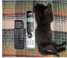
قطعة مستلقية بجانب جهاز تحكم عن بعد