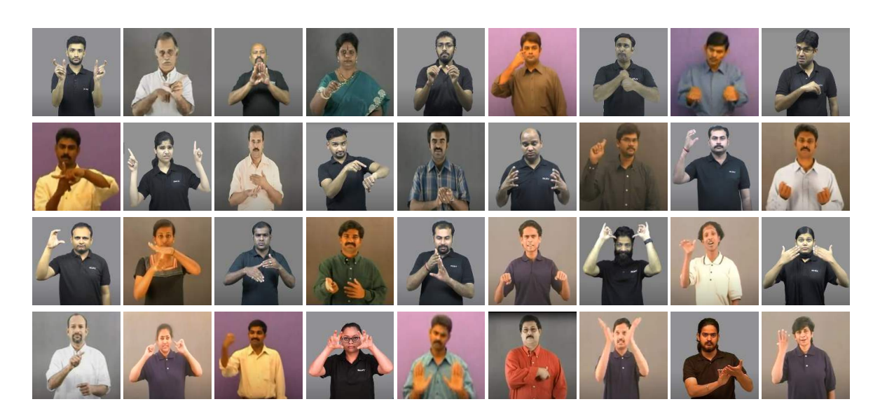
Figure 6: An image showing the diversity of signers in the acquired corpus for Indian Sign Language.