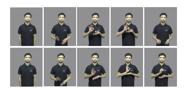
Figure 1: An example of the same signer showing different signs for the same word "Buddhist." Though the movement of the arm is similar, the hand gestures differ.

Existing works in natural language processing have shown promising improvements in text classification, translation as well as generation in widely used spoken languages. However, sign language, on the other hand, still lacks sufficient resources for developing models using data-driven approaches, leading to low improvements in tasks like translation and generation. One such low-resource sign language includes Indian Sign Language (ISL). As per the 2011 Indian Census, there are about 6 million deaf people in India (Wikipedia, 2022). According to Ethnologue (a reference publication documenting information about living languages of the world), ISL is the most widely used sign language in the world, and it is 151st most "spoken" language in the world (Ethnalogue, 2022).