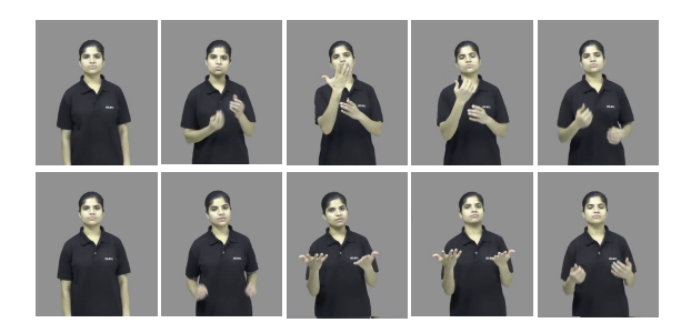
Figure 4: An example of same signer showing different signs for the same word "start." Though the movement of the arm is similar, the hand gestures differ.