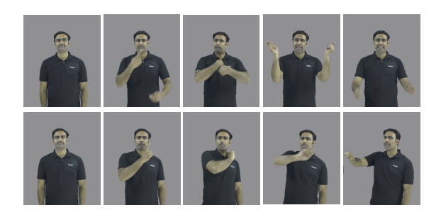
Figure 5: An example of same signer showing different signs for the same word "triumph." Though the movement of the arm is similar, the hand gestures differ.