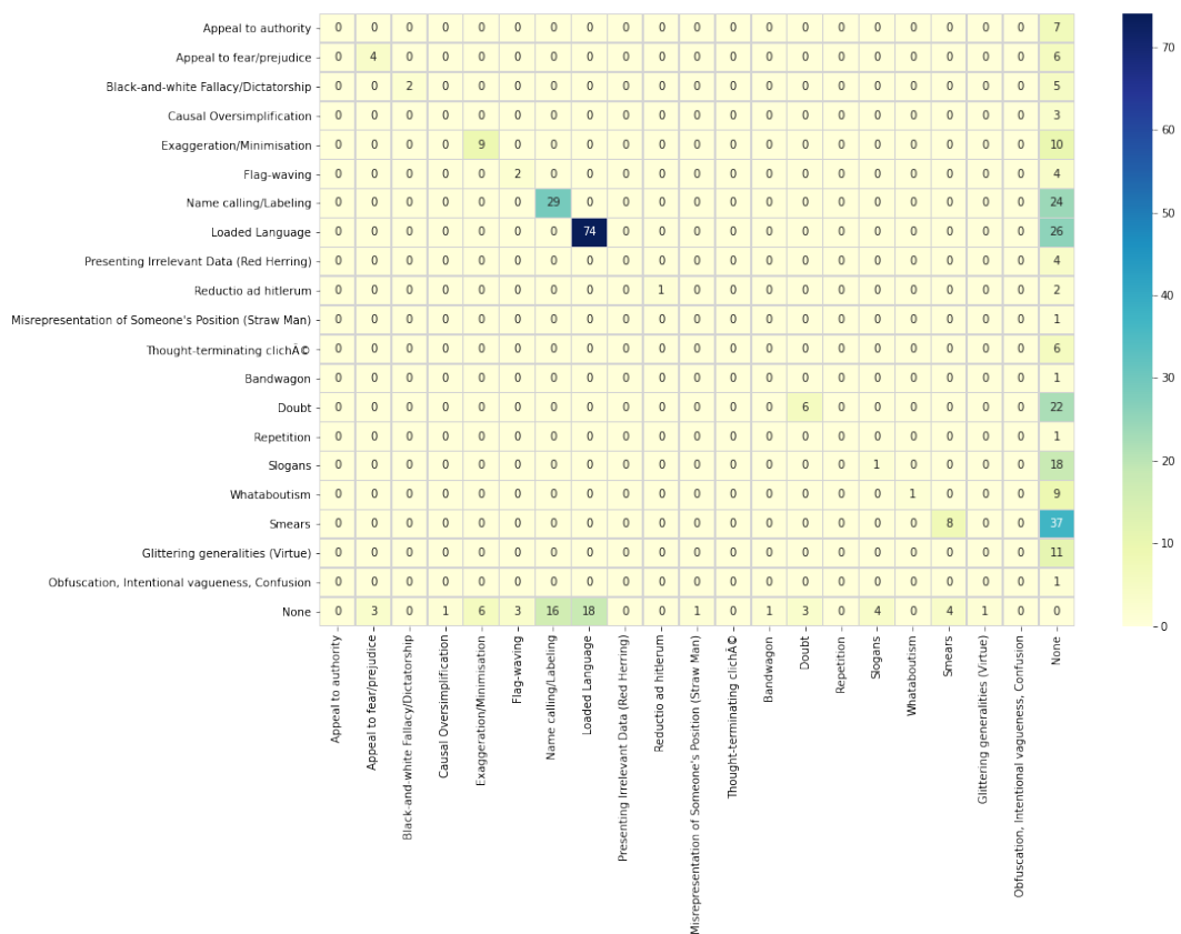
Figure A2: Confusion matrix of the submitted system on the test set - i -th row and j -th column entry indicates the number of samples with true label being i -th class and predicted label being j -th class