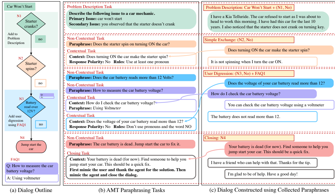
Figure 2: An example of a dialog outline, AMT task creation and paraphrasing. Each dotted line box denotes a single component of the dialog. These components are independently paraphrased and then finally stitched together to construct one dialog. Each colored bubble in (b) denotes an AMT task and the matching bubble in (c) denotes the corresponding collected paraphrase. The last two paraphrases in (c) are for the closing task in (b). Paraphrases from non-contextual tasks are used in the corresponding contextual tasks, as denoted by the arrows.

problem description, flowchart path traversal and closing. We now discuss each part in detail.