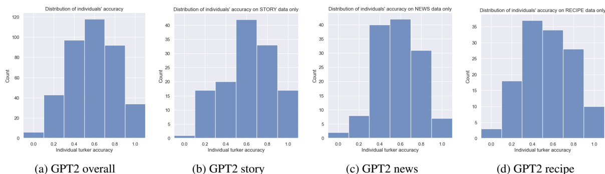
Figure 3: Histogram of scores classifying human and GPT2 texts.