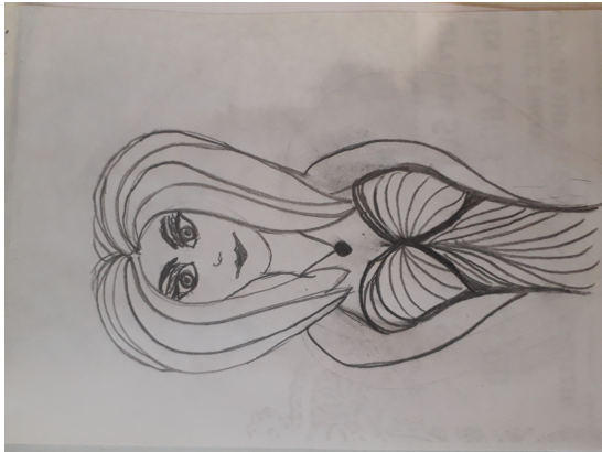
(a) "People pleasing, inoffensive"