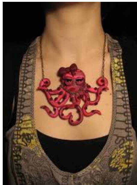
(b) "Funny, with the ability to invoke laughter but also to empathise and advise. An entity that I could trust completely."