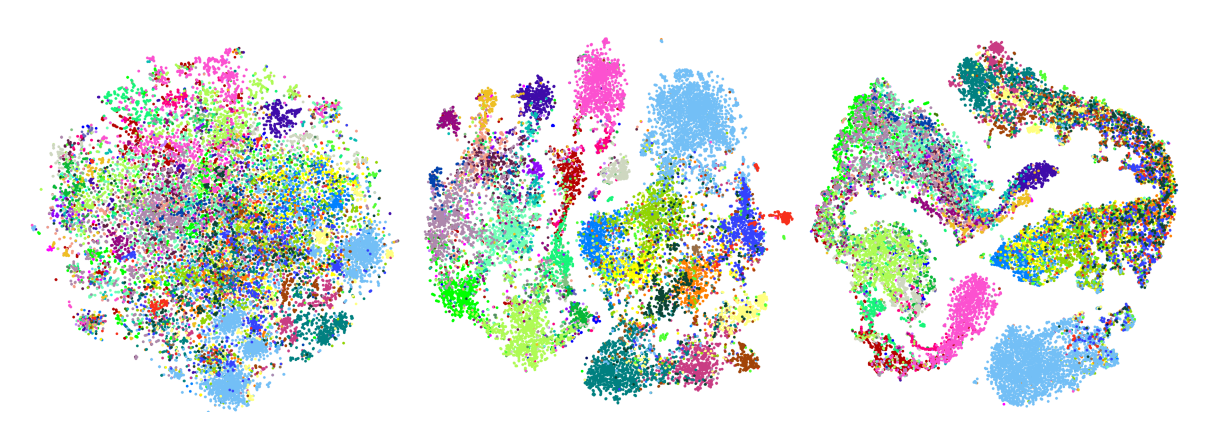
Figure 3: The t-SNE visualizations of the test data using embeddings from different models. Models: BERT embeddings (left), BERT+SCL embeddings with \tau = 0.2 (middle), BERT+SCL embeddings with \tau = 1.0 (right). Different colors refer to different supersenses.