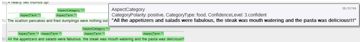
Figure 2: A sentence in the BRAT tool, annotated with four aspect terms (‘appetizers’, ‘salads’, ‘steak’, ‘pasta’) and one aspect category (FOOD). For aspect categories, the whole sentence is tagged.

place and good pizza” it probably refers to the ambience of the restaurant. A broader context would again help in some of these cases.