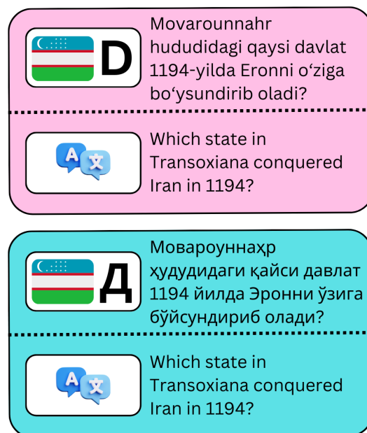
Figure 2. A sample question from the parallel Uzbek dataset, available in both Cyrillic and Latin alphabets. This enables comparison of LLM performance across different scripts. English translation is provided for clarity.

Benchmarks for Turkic languages SeaEval was one of the first LLM benchmarks to include Turkish (Wang et al., 2024a). Global MMLU contains Kyrgyz and Turkish subsets. INCLUDE contains Azerbaijani and Kazakh. MRL 2024 Shared Task on Multi-lingual Multi-task Information Retrieval (Tinner et al., 2024) contains an Azerbaijani dataset, but it contains general language understanding tasks rather than world knowledge. Kardeş-NLU has introduced a multilingual