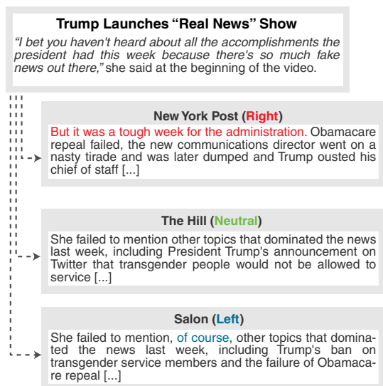
Figure 2: Three news articles on the event Trump launches “real news” show . Some bias indicators in the articles are highlighted. Representing three different points of view, the articles provide completely different interpretations of the event.

discriminate the two respective types best. Specifically, the discriminativeness of a word w can be measured in terms of the discriminativeness ratio