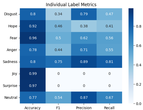
Figure 1: Individual label accuracy, precision, recall and F-1 score of the baseline model on the development dataset.

We trained the BERT model using TensorFlow, with a learning rate of 2e-05, binary cross-entropy as the loss, and the Adam optimizer. We trained the model for 25 epochs, with a batch size of 16. To prevent over-fitting, we implemented early stopping by monitoring the validation loss. To optimize the threshold on the logits for the labels, we performed a random search. As we trained the model, our training loss kept going down, but after a point, the validation loss did not go down. Instead it increased. This is a sign of overfitting. Figure 1 shows us how the baseline model performed for each individual label.