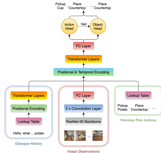
Figure 3: This depicts the architecture for the E.T.-based models. The basic E.T. model does not have a connection between the action and object heads, but E.T. Hierarchical does. There are three main input processing components (dialogue history, image observation, and previous plan actions). These are then input into the positional and temporal encodings and transformer layers to develop the next feasible set of high-level plan actions.

This section discusses the Episodic Transformer (E.T.) Model (Pashevich et al., 2021) along with our modifications in greater detail. For convenience, we include a diagram of the model in Figure 3. The E.T. model receives language (in our case, EDH dialogue history) and egocentric image observations of size 900 x 900 as input. Visual observations are first resized to 224 x 244 and then encoded using a visual encoder that is based on a Faster R-CNN model trained on 325K frames of expert demonstrations from the ALFRED train fold (which comprises seen splits of TEACH) and not finetuned in any of our experiments. This encoder average-pools ResNet features four times and adds