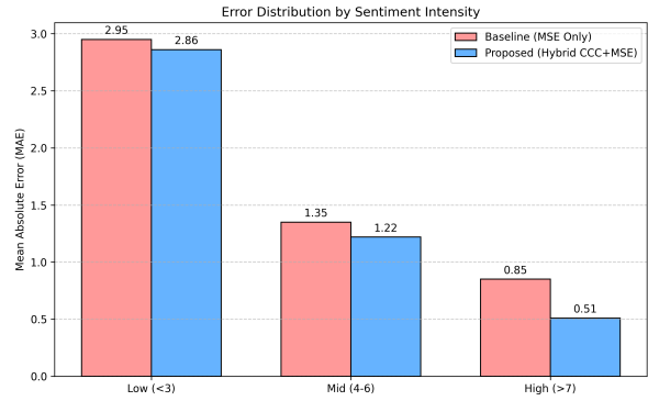
Figure 2: Ablation bar chart comparing baseline and hybrid performance across sentiment intensity bins.

The domain-level results in Table 1 show that the proposed system remains consistent across both evaluation settings. The Restaurant domain yields slightly stronger PCC scores, suggesting that ex-