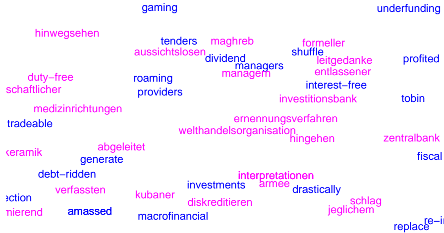
Figure 2: Bilingual Embeddings of German and English words about banking and financial

in this aspect. Overall, the BiSkip-MonoAlign model exhibits very similar monolingual properties as in the BiSkip-UnsupAlign one, i.e., it clusters all months together and even places \{google, patents, merger, software, copyright\} as closest words to microsoft . On the other hand, the BiSkip-MonoAlign fails to find correct translations for the word distinctive , emphasizing the fact that knowledge about word alignment does offer the BiSkip-UnsupAlign model an advantage.