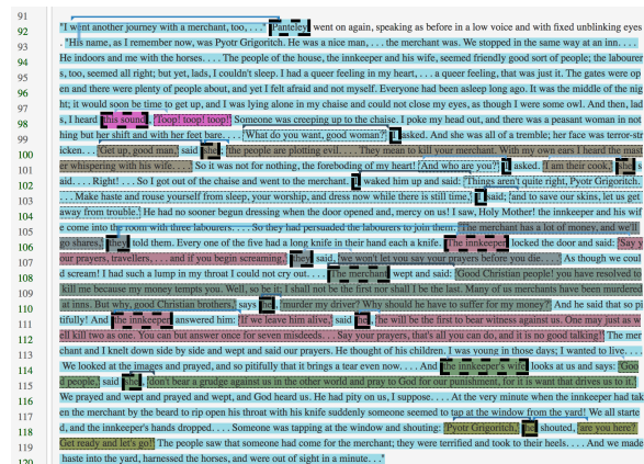
Figure 2: An example paragraph that contains multiple speakers from The Steppe

Figure 2 shows a screen shot of our annotation tool displaying a paragraph with a complex conversational structure from The Steppe .