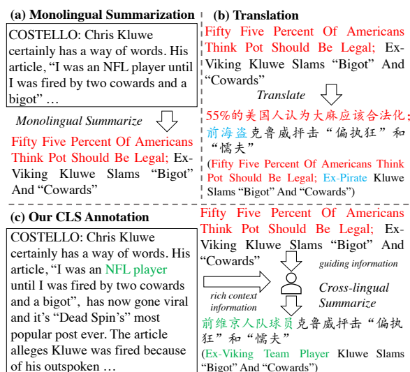
Figure 1: An En-Zh summary from Wang et al. (2022a) (best viewed in color). We compare “pipeline: (a)→(b)” annotation protocol and our annotation (c) protocol. Pipeline annotation results in errors from both summarization (red: unmentioned content/hallucination) and translation (cyan: incorrect translation) processes. To address this issue, we explicitly annotate target-language summaries with faithfulness rectification (green) based on input context, with the guidance of mono-lingual summaries.

With the advance in deep learning and pre-trained language models (PLMs) (Devlin et al., 2019; Lewis et al., 2020; Raffel et al., 2020), much recent progress has been made in text summarization (Liu and Lapata, 2019; Zhong et al., 2022a; Chen et al., 2022a). However, most work focuses on English (En) data (Zhong et al., 2021; Gliwa et al., 2019; Chen et al., 2021), which does not consider cross-lingual sources for summarization (Wang et al., 2022b). To address this limitation, cross-lingual summarization (CLS) aims to generate summaries in a target language given texts from a source language (Zhu et al., 2019), which has shown values