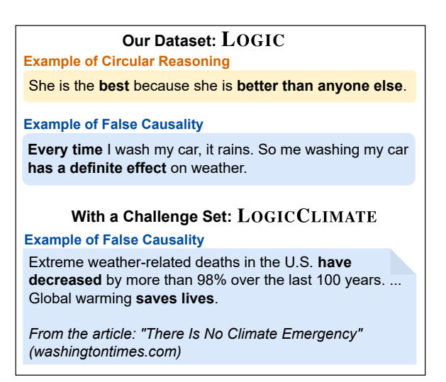
Figure 1: Our dataset consists of general logical fallacies (LOGIC) and an additional test set of logical fallacies in climate claims (LOGICCLIMATE).

Reasoning is the process of using existing knowledge to make inferences, create explanations, and generally assess things rationally by using logic (Aristotle, 1991). Human reasoning is, however, often marred with logical fallacies. Fallacious reasoning leads to disagreements, conflicts, endless debates, and a lack of consensus. In daily life, fallacious arguments can be as harmless as "All tall people like cheese" (faulty generalization) or "She is the best because she is better than anyone else" (circular claim). However, logical fallacies are also intentionally used to spread misinformation, for instance "Today is so cold, so I don't believe in global