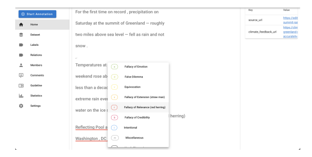
Figure 4: Choices of logical fallacy types in the annotation interface of the LOGICCLIMATE challenge set.