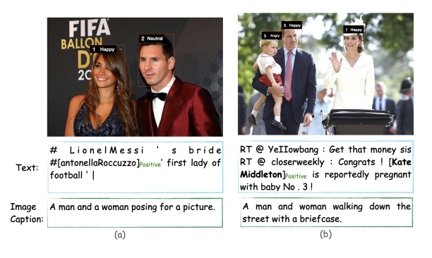
Figure 1: Examples of multimodal aspect-based sentiment analysis with image caption.

Early works (Xu et al., 2019; Yu and Jiang, 2019; Wang et al., 2021) on the MABSA task treat the