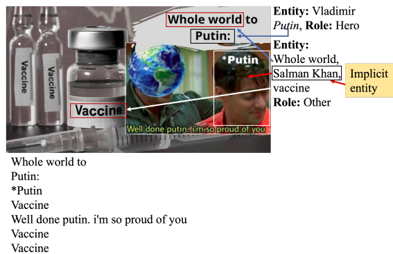
Figure 1: An example image showing the implicit ( Salman Khan ) and the explicit entities (from a text perspective) and their roles.

We use the dataset provided for the CONSTRAINT 2022 shared task. It contains harmful memes, OCR-extracted text from these memes, and manually annotated entities with four roles: hero , villain , victim , and other . The datasets cover two domains: COVID-19 and US Politics. The COVID-19 domain consists of 2,700 training and 300 validation examples, while US Politics has 2,852 training and 350 validation examples. The test dataset combines examples from both domains, COVID-19 and US Politics, and has a total of 718 examples.