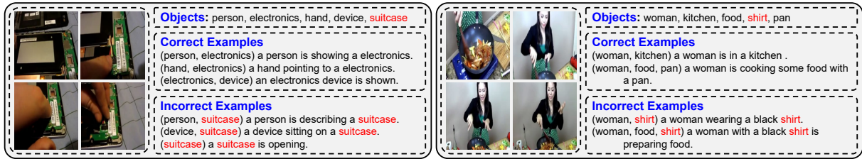
Figure 3: Examples of captions generated by our proposed O2NA. For each example, the left plot shows the input video. The upper, middle and lower parts in the right plot show the predicted objects, correct examples and error cases, respectively. The designated objects are listed in brackets. The color Red denotes unfavorable objects.

ure 3 shows that our approach is controllable and explainable. Specifically, it can generate multiple diverse captions for the same video, and can accurately follow the selected objects we care about. Besides, we find that the error mainly takes place when there are incorrectly predicted objects, e.g., “suitcase” and “shirt”. O2NA mistakes the incorrect object for an appropriate one during its object sequence generation. A more powerful object predictor may be helpful in solving these problems, but it is unlikely to be completely avoided.