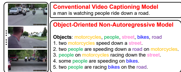
Figure 1: Examples of the captions generated by a state-of-the-art conventional video captioning model (Zheng et al., 2020) and our model. Compared to the conventional model, whose generation process is hardly controllable, our model can be guided to mention the desired objects (i.e., the colored objects) and generate diverse, object-oriented captions for a video.

in advancing the state-of-the-art (Pan et al., 2020; Zheng et al., 2020; Perez-Martin et al., 2021; Yang et al., 2021). These models usually entail the autoregressive property, i.e., conditioning each word on the previously generated words.