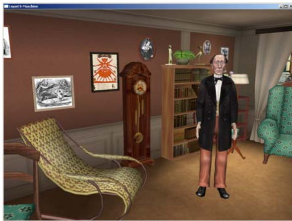
Figure 1. HCA in his study.

The primary use setting for the HCA system is in museums and other public locations. Here, users from many different countries are expected to have conversation with HCA for an average duration of, say, 10-20 minutes. The target users are 10-18 years old children and teenagers.