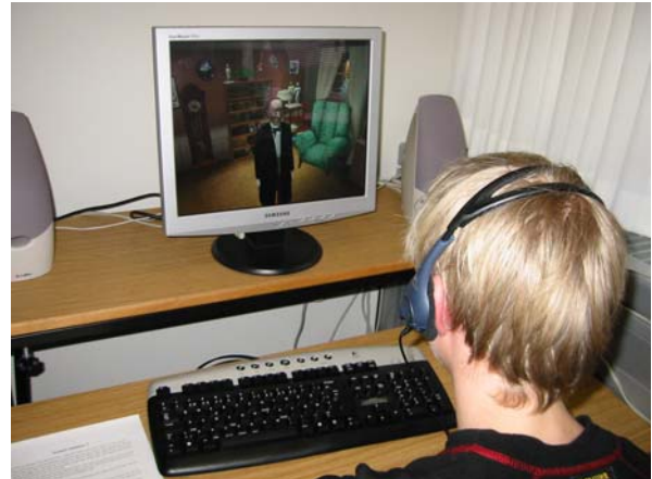
Figure 6. A young user talking to HCA.

detects through communication with Animation (Figure 5) the object(s) the user gestured at and outputs equivalents to 'no object', 'a single named object', and 'several named objects'. Like Speech recognition, Gesture interpretation is inhibited during preparation and synthesis of HCA's verbal and non verbal behavior. Input fusion attempts to fusion linguistic input frame deictic expressions and references to gesturable objects with objects from Gesture interpretation.