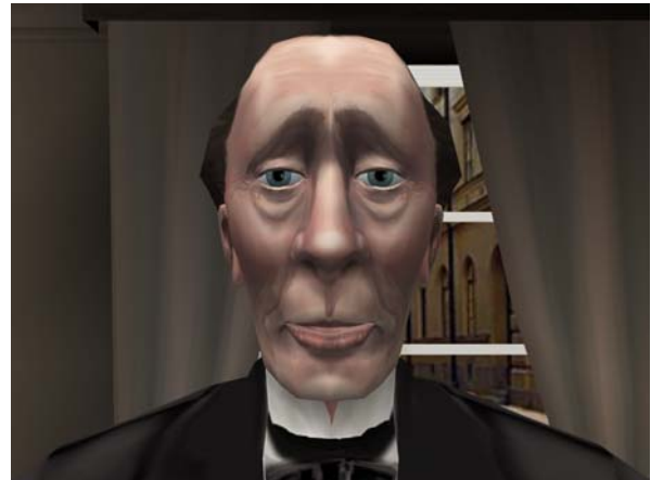
Figure 2. Close-up of a sad Andersen.

childhood games and games users like; his physical and personal presence; his study, including many of the objects in there. He gathers information about the user and understands a variety of generic input, including various forms of user-initiated meta-communication. The objects that the user can get information about via gesture and gesture/speech input are the 16 pictures on the walls, a feather pen and a travel bag.