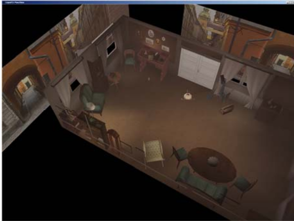
Figure 4. A view from above of HCA's study.