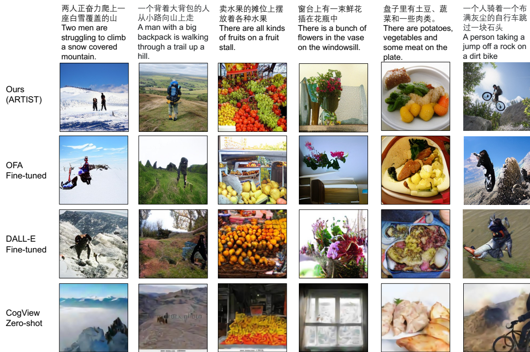
Figure 4: Qualitative comparison of images generated from the COCO-CN and Flickr8k-CN datasets (natural scene).