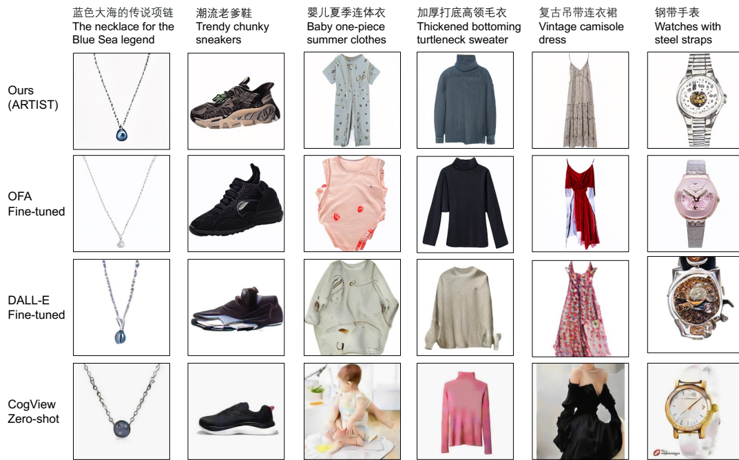
Figure 3: Qualitative comparison of images generated from the MUGE dataset (e-commerce products).