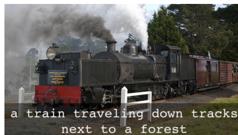
(a) General image caption.