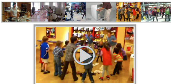
The video summarization system thinks this video is about Birthday Party because it found 3 Or More People Meeting in Indoor. From the video, the system heard the sound of music at first, then cheer, and then speech. The system observed food, people, room and indoor in the video.

We demonstrate the video summarization system in a dynamic web page. A screen shot of the demo page can be seen in Figure 2. The top gallery shows several videos for selection. The user can choose a video by clicking on it, and the selected video will play in the main area of the page. Once a video is selected and playing, a summary paragraph will be automatically generated and displayed underneath the video, presenting the video’s information in natural language.