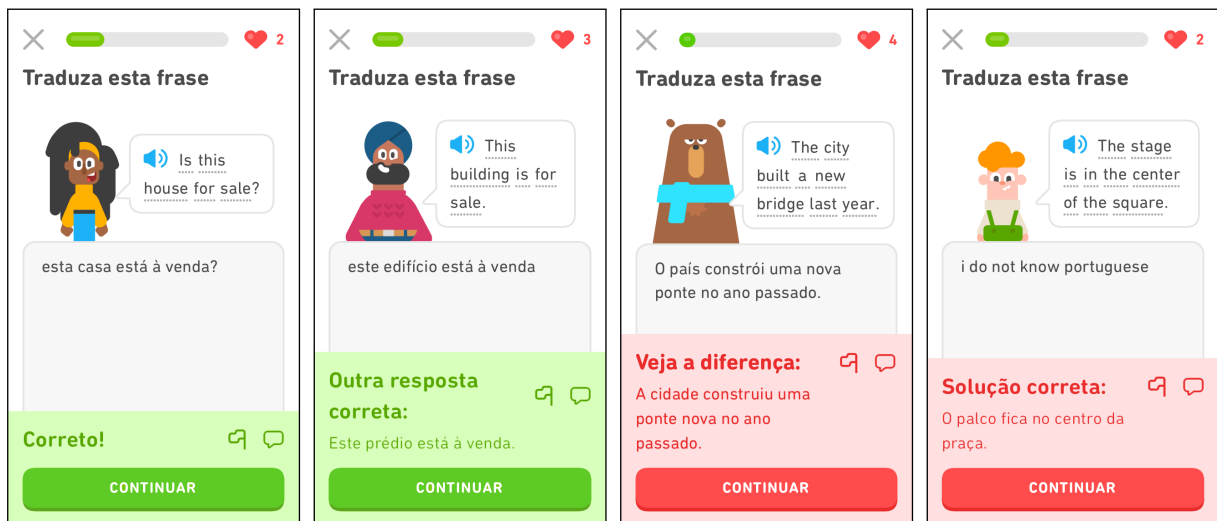
Figure 1: Screenshots from the Duolingo app (iOS, circa 2020), showing translation exercises for English prompts into Portuguese. The first two examples show correct student translations, with Duolingo suggesting an alternate, preferred translation in the second case. The third and fourth responses show incorrect translations.

field-tested accepted translations , each weighted and ranked according to their empirical frequency among Duolingo learners. We also provide a high-quality automatic reference translation of each prompt that may (optionally) be used as a reference or anchor point, in the event that researchers want to explore paraphrase-only approaches (this also serves as a strong baseline). See Table 1 for an example from the Portuguese dataset.