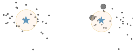
Figure 1: The figure on the left shows the cluster center ( \star ) without weighting, while the figure on the right shows that after weighting (larger points have higher weight) a hopefully more representative cluster center is found. Note that top words based on distance from the cluster center could still very well be low frequency word types, motivating reranking (§3.3).

After preprocessing and extracting the vocabulary from our training documents, each word type is converted to its embedding representation (averaging all of its tokens for contextualized embeddings; details in §5.3). Following this we apply the various clustering algorithms on the entire training corpus vocabulary to obtain k clusters, using weighted (§3.2) or unweighted word types. After the clustering algorithm has converged, we obtain the top J words (§3.1) from each cluster for evaluation. Note that one potential shortcoming of our approach is the possibility of outliers forming their own cluster, which we leave to future work.