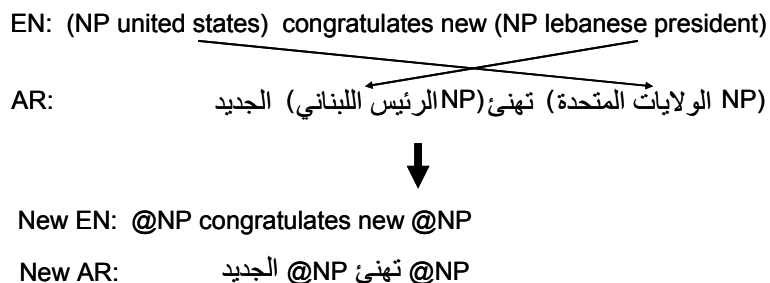
Figure 2: Tagging of NPs

To evaluate the accuracy of NP translations, and also to estimate how often the Arabic translation of an English NP is indeed an NP, a sample of NP translations was evaluated by an Arabic native speaker. 90% of the resulting Arabic translations were NPs. Out of these NPs, 11% had some irregularities such as missing articles in one side, etc. 10% of Arabic translations were either incorrect or not NPs (e.g. verb phrases).