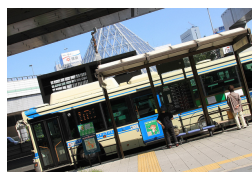
Figure 1: An image with the top five captions from standard beam search and from random sampling. Note the latter set is more diverse but lower quality.

A bus parked at a bus stop at a bus stop. There is a bus that is at the station. A man standing by a bus in a city. A bus pulling away from the train station. A bus stopped at a stop on the sunny day.