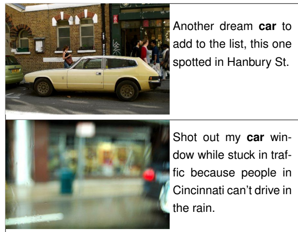
Figure 1: Two image/caption pairs, both containing the noun “car” but only the top one in a visual context.

The ability to automatically identify visual text is practically useful in a number of scenarios. One can