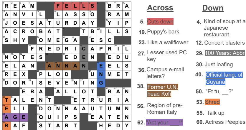
Figure 1: Crossword puzzle example. A few clues from the puzzle have been provided on the right, they are filled horizontally (Across) or vertically (Down) in the crossword grid. The clue number tells the player where in the grid the answer needs to be filled in. Some of these clue and their answers have further been highlighted with different colors which belong to different clue categories as described in Section 3.2, color-coded in accordance with Figure 2. Highlight colors denote distinct clue categories: red for word meaning clues, purple for fill-in-the-blank clue, orange for synonym/antonym, blue for factoid question type, grey for abbreviation and brown for historical.