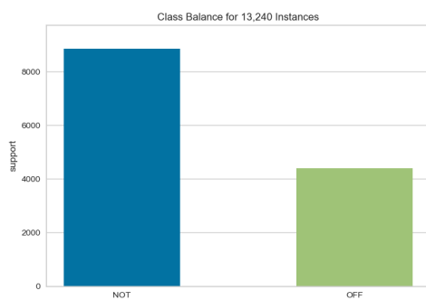
Figure 1: Distribution of classes (OFF - Offensive and NOT - Not Offensive) for Sub-task A.)