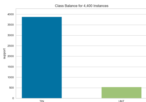
Figure 2: Distribution of classes (TIN - Targeted Offense and UNT - Untargeted Offense) for Sub Task B.)

The dataset provided for the tasks was collected through Twitter API by searching for tweets containing certain selected keyword patterns popular in offensive posts. Around 50% of the keyword patterns were political in nature such as ‘MAGA’,