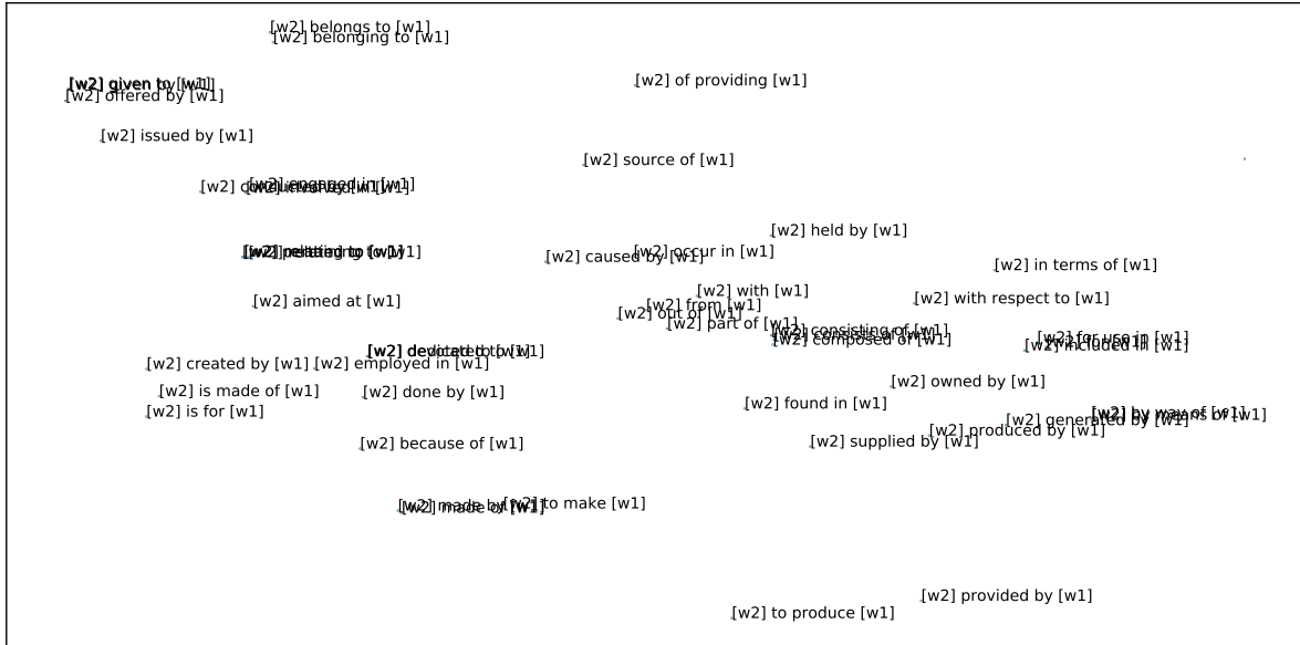
Figure 2: A t-SNE map of a sample of paraphrases, using the paraphrase vectors encoded by the biLSTM, for example bLS([w_2] made of [w_1]) .

Implementation Details. The model is implemented in DyNet (Neubig et al., 2017). We dedicate a small number of noun-compounds from the corpus for validation. We train for up to 10 epochs, stopping early if the validation loss has not improved in 3 epochs. We use Momentum SGD (Nesterov, 1983), and set the batch size to 10 and the other hyper-parameters to their default values.