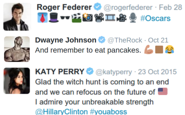
Figure 1: Examples of tweets that include emojis.

In the tweet of Dawayne Johnson we can also see another emoji, a brown square 🟩. In this context it is used to symbolize a rock (as his stage name is The Rock ), and close to the arm emoji, it would probably means "strong like a rock", like himself. The use of emojis strongly depends