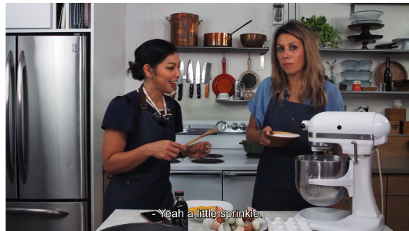
Figure 3: Sprinkling used in a kitchen in reference to sugar.

Therefore, in the future, it would be useful to annotate metaphors also in the other modalities. Money flying can be a visual metaphor, and so can a sound effect, and they can exist independently from each other in different modalities. Perhaps the reason why our multimodal attempts failed was that metaphor can be independent of the other modalities. Producing such a dataset where these modal specific metaphors are also annotated for video and