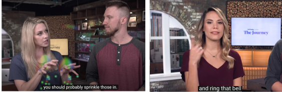
Figure 1: Metaphors made visible in the video through gestures.

talking about sprinkling keywords and showing a sprinkling gesture. On the right, the woman wearing the wine red shirt says ring that bell and shows a bell ringing gesture.