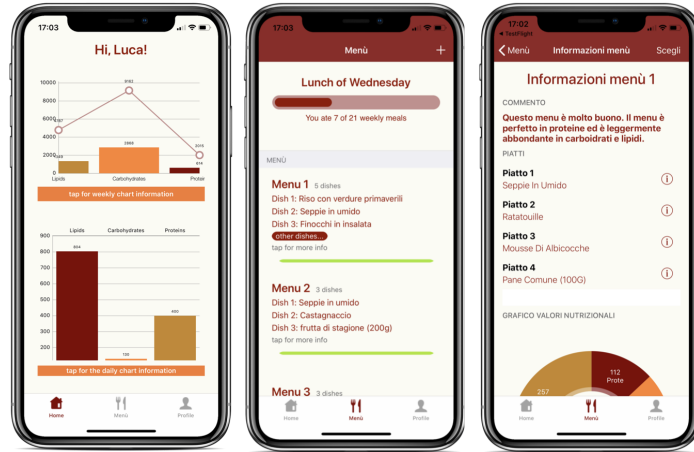
Figure 2: Three screenshots of CheckYourMeal.

The user interface is structured in three sections: the Home section, where the users are provided with general information, the Menu section, where the users can see the suggestions for the next meal and where they can input the chosen meals, and the Profile section, where the users can modify settings and user parameters. In the Menu section (central screenshot in Fig. 2), the user is presented with some suggestions of meals taken from a precompiled database of menus which are ordered by their distance from the ideal values of the dietary reference values. When a user selects a specific menu, CheckYourMeal! shows both (1) a pie-chart and (2) a textual message which contains information about the macronutrients values of the chosen menu.