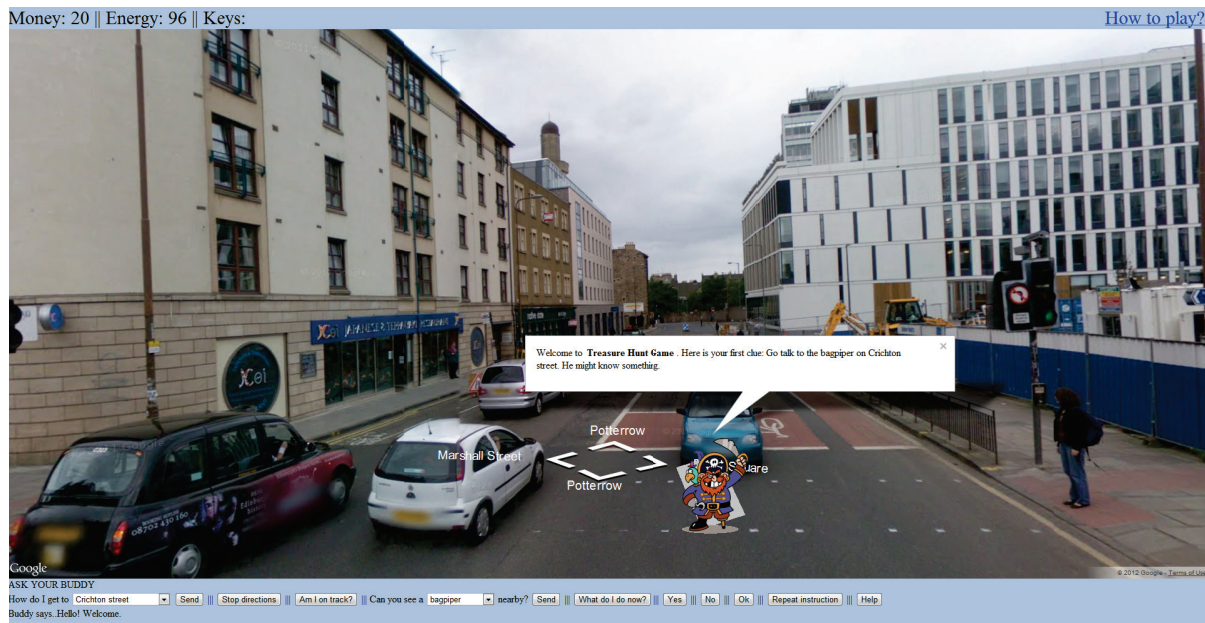
Figure 2: Snapshot of the web client