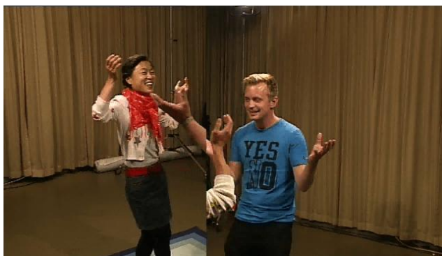
Figure 1: Mirroring behaviours

having experienced negative events (Rimé et al., 1998). Figure 1 shows an example of mirrored behaviour in the first encounters. In the picture, both participants laugh and make the same arm movement showing that they are amused. The main aims of the present work are thus to de-