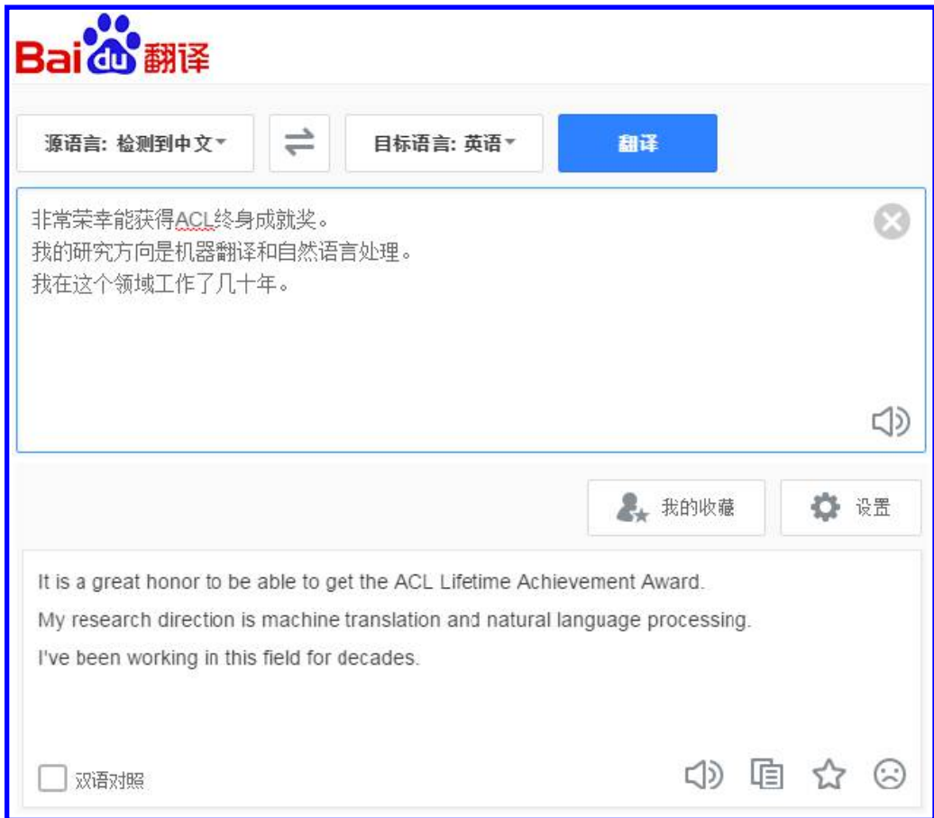
Figure 2 Examples of the Baidu online machine translation service.

This is a sweet annoyance. To handle big data, we have developed fast training and parallel decoding techniques in our project.